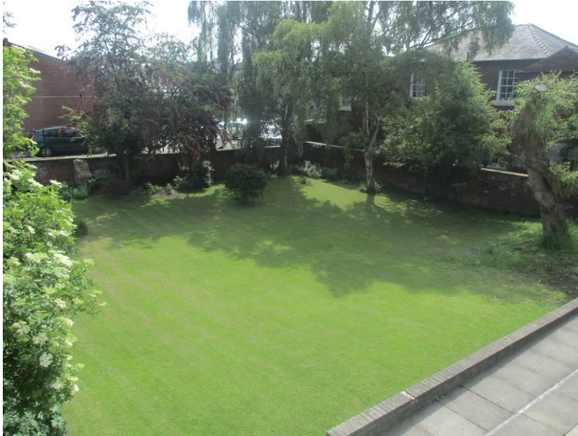
Figure 2: Burial ground

The burial ground is located to the east of the site. The burials cover a period approximately from 1826 to 1953. This is no longer used for burials but is still used for the scattering of ashes. Formerly, flat stones were laid in rows; however these were relocated to the perimeter in the 1960s (Fig.3). The burial ground is mainly laid to grass with low level planting and trees around the edge. The burial ground is enclosed by red brick walls dating from the nineteenth century.