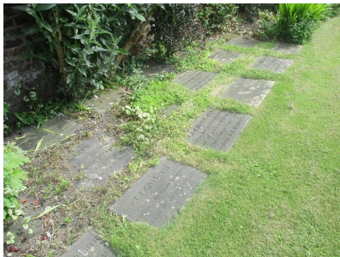
Figure 3: Relocated gravestones